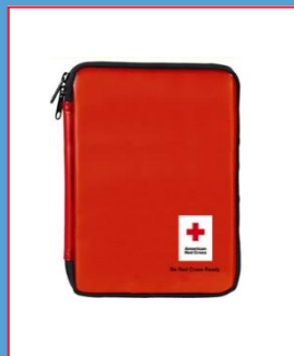
Red Cross First Aid Kit