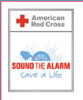
Sound the Alarm Lapel Pin

To show our appreciation for your hard work in raising funds during Sound the Alarm , we want to recognize you with a small token of our thanks. All Sound the Alarm participants who fundraise on CrowdRise are eligible to earn items of recognition.