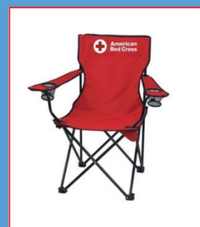
Stylish Folding Chair